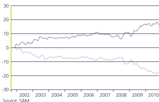
SUSTAINABILITY INVESTING PAYS OFF Cumulative Outperformance in %

— Sustainability Leaders (Top 20%) — Sustainability Laggards (Bottom 20%)